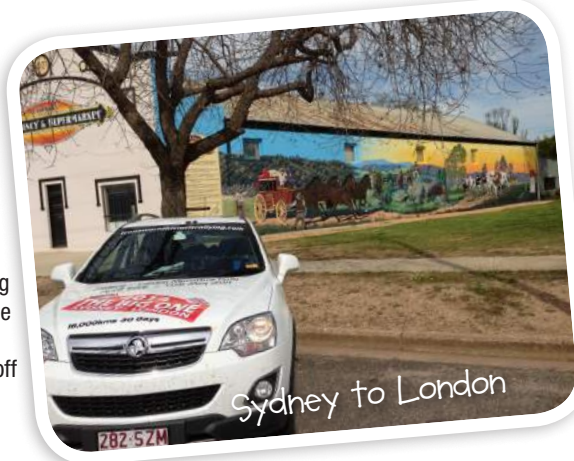
Sydney to London