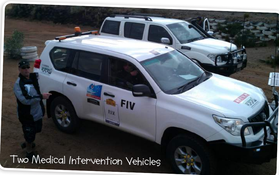
Two Medical Intervention Vehicles

Given the increase in the number of entries for COT 2014 the organisers have determined to engage two Medical Intervention Vehicles (MIV) from Motorsport Safety and Rescue, each with a doctor and paramedic, and necessary equipment for emergencies. Given the 'linear' nature of the event, where special stages are spread out over a considerable distance (compared to loops), the organisers recognise the need to extend the MIV service to provide for intervention at an incident involving injury as quickly as possible. The MIV's communication will be part of the RallySafe system, to provide the medical staff with the quickest possible messages.